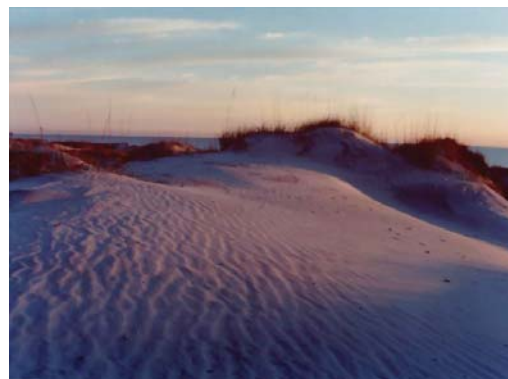
Sand dunes on Amelia Island at dusk

Contact the National Office for more information!