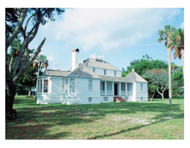
FRIDAY, NOVEMBER 3, 2006 KINGSLEY PLANTATION

St. Augustine, the nation's oldest city, also holds the distinction of being one of the nation's most charming. Known as the "Ancient City" St. Augustine's attractions bring to life the history, adventure, and romance of the Old City. With more than four centuries of colorful local history to draw from, the more than 60 unique-themed attractions in St. Augustine bring to life the history and romance of the area. Complementing the historicallythemed attractions are contemporary adventures never imagined by the ancient explorers. The combination of historic sites and modern-day storytelling make the attractions of St. Augustine one of the most popular features of the oldest, continuously occupied European settlement in the continental United States. This tour will offer participants the opportunity to visit the city on a guided trolley while maintaining the ability to step off the trolley and explore at various stops. For more information visit www.oldcity.com.