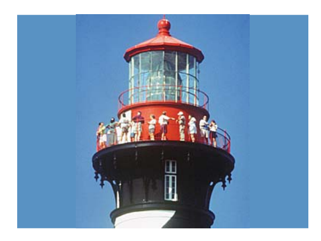
THURSDAY, NOVEMBER 2, 2006 ST. AUGUSTINE . . . THE OLDEST CITY IN AMERICA!

Companion Registrant Information – Companion Conference Registration Fee includes all breakfasts, Wednesday evening Welcome Reception, transportation to and from the companion tours and the Thursday evening Social Event. Educational sessions are not available to companions.